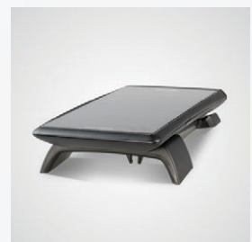
eBase for charging and software updates included in delivery volume. Can also be used as a mobile mini-POS solution.