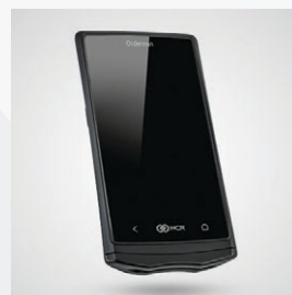
Orderman5+: The plus model with NFC reader (ideal for access systems) and Bluetooth connects to the belt printer.