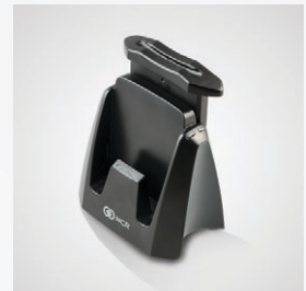
Dual battery charger with fast-charging and maintenance modes.