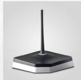
Orderman Secure Radio: uniquely stable and secure.

When developing the Orderman5, we concentrated fully on the functions required to run the most profitable operation possible. You'll get everything you need - and nothing you don't need. With Orderman5 you receive a device that meets the highest industry standards and is guaranteed to improve your financial success. Our unique mobile ordering system can provide you with up to 25% more sales. In addition, everyone will be impressed by your excellent service.